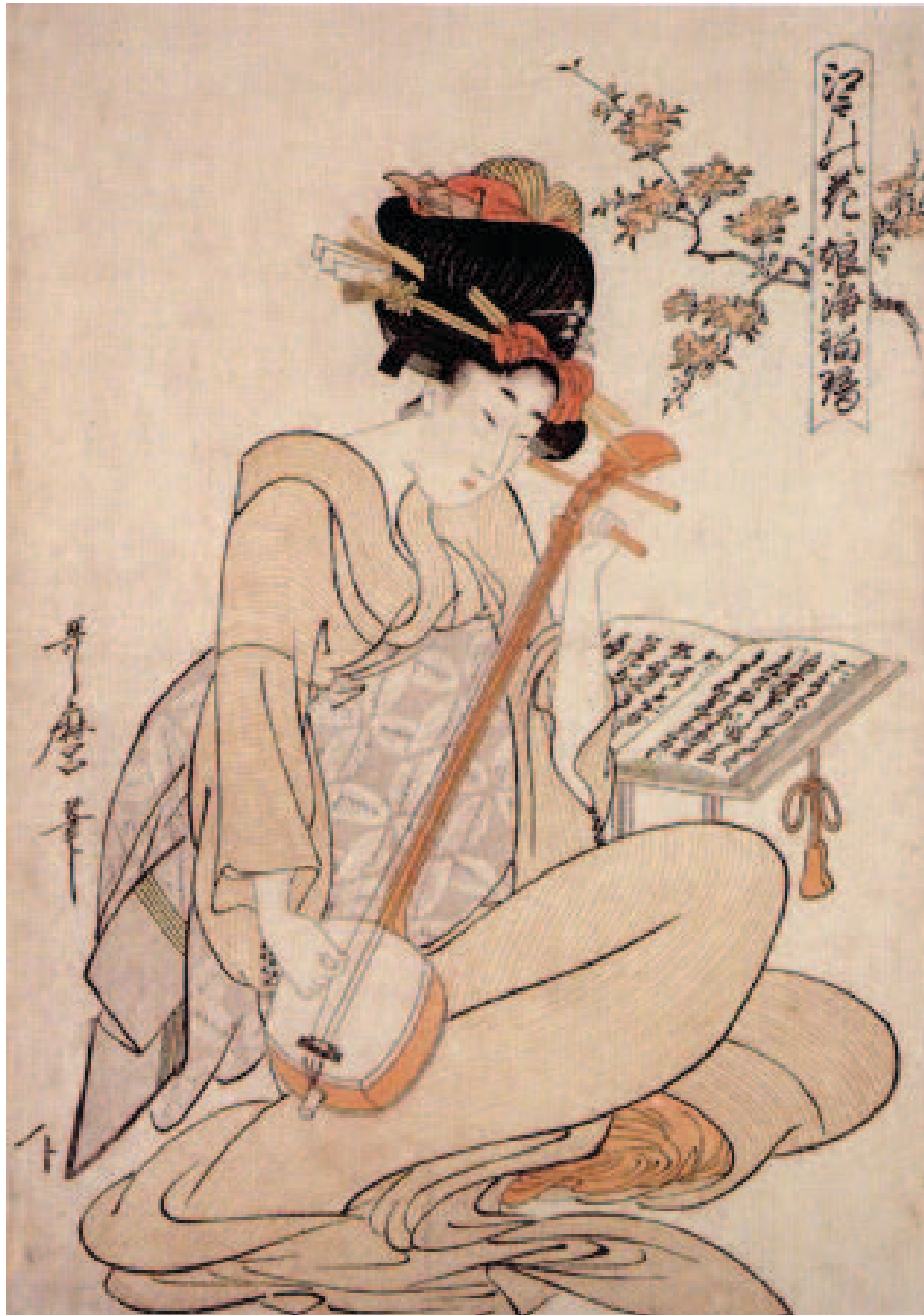
"Flowers of Edo: Young Woman's Narrative Chanting to the Samisen"