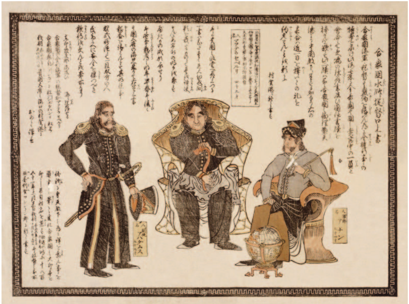
Gasshukoku suishi teitoku kōjōgaki (Oral statement by the American Navy admiral) Print on hōsho paper : woodcut, color ; 31.5 x 43 cm. (block), 34.7 x 46.8 cm. (sheet), c. 1850-1900.