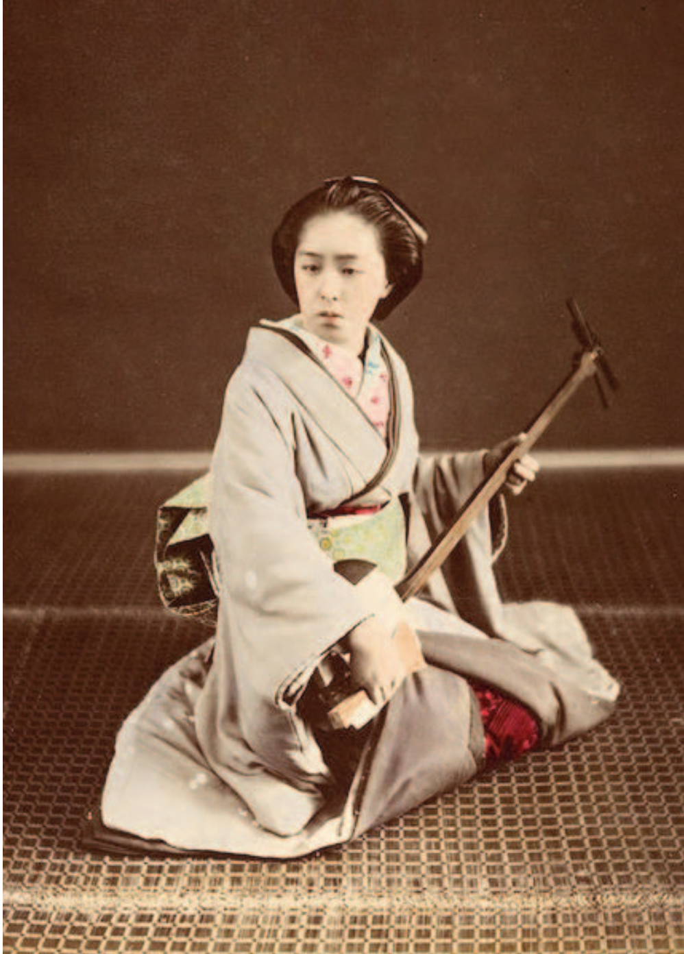
Tokyo Geisha with Shamisen. Hand-tinted photo taken c. 1870s.