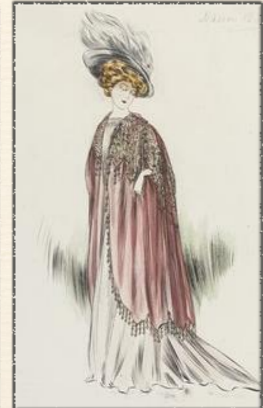
Images of Manon - Victoria and Albert Museum https://www.vam.ac.uk/collections/fashion