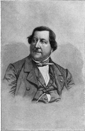
GIOACCHINO A. ROSSINI.