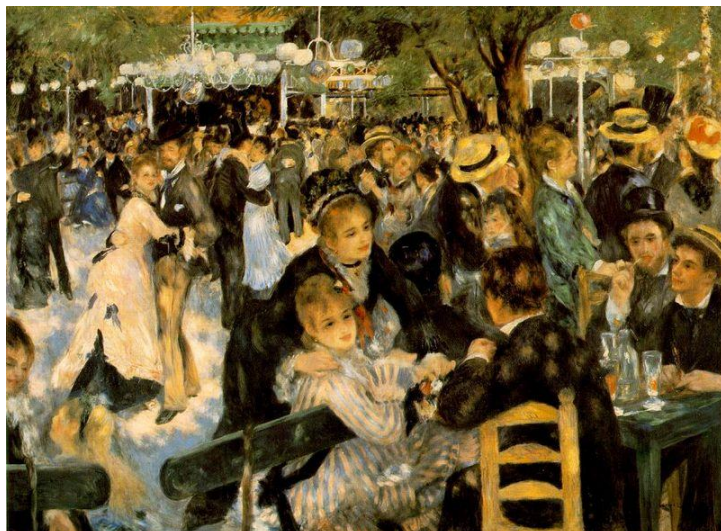
Dance at le Moulin de la Galette Pierre-Auguste Renoir (1841–1919) 1876 Oil on canvas

This painting was shown at the “Exhibition of the Impressionists” in April 1874, and is the painting attributed to giving rise to the name of the Impressionist movement. It depicts the port of Le Havre, Monet’s hometown, and is his most famous painting of that harbor.