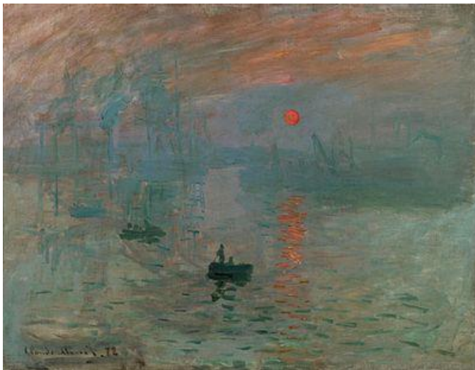
Impression, Sunrise Claude Monet (1840–1926) 1872 Oil on canvas

Movements in visual art and music tend to reflect each other in any given time period, due to the fact that the cultural elite tended to share social circles. This period in visual art was transitional, as artists moved away from Realism (the attempt to represent subject matter truthfully, without artificiality) toward Impressionism (a movement characterized by relatively small, thin, yet visible brush strokes, open composition and emphasis on accurate depiction of light in its changing qualities). Here are some paintings produced around the time that Manon premiered in 1884. These will help you get a sense of not only why the music sounds the way it does, but what costumes, set pieces and other visual aspects of the opera may have looked like back then!