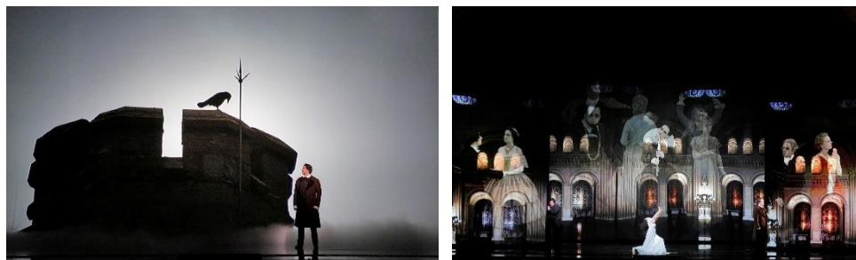
Scenes from Gordon Getty's Usher House, 2015.