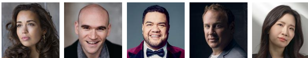
Nadine Sierra; Michael Fabiano; Pene Pati; Lucas Meachem; Eun Sun Kim