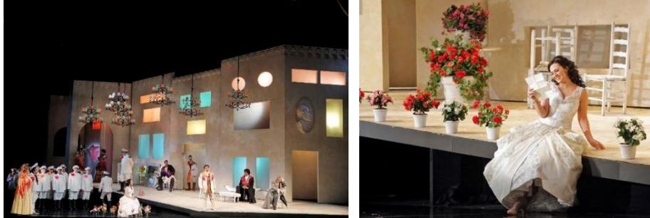
Scenes from The Barber of Seville.