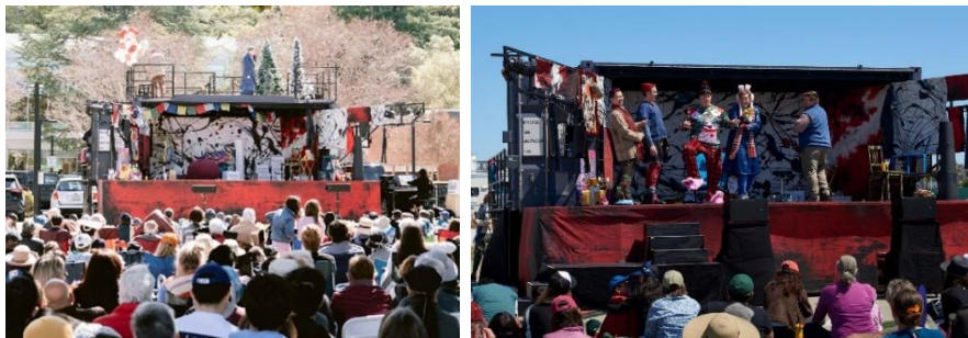
Scenes from Bohème Out of the Box.