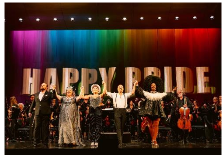
Rossini's The Barber of Seville ; Strauss and Hofmannsthal's Elektra ; Pride Concert.

Tickets available at (415) 864-3330 and sfopera.com