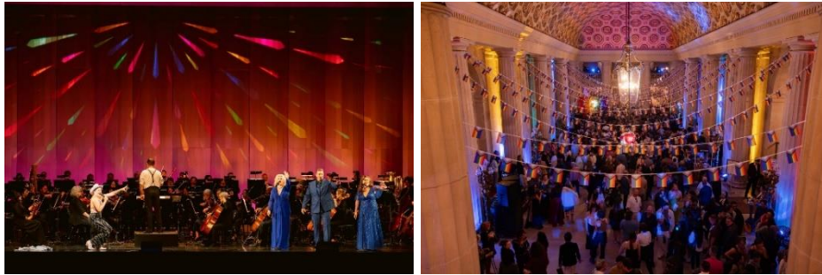
Pride Concert.

San Francisco Opera presents its second Pride Concert in the Opera House on Friday, June 26, the eve of San Francisco's Pride Weekend. The one-night-only event features the San Francisco Opera Orchestra on stage in a program celebrating LGBTQIA+ composers, performers, anthems and more. Following the concert, a dance party ensues in the main lobby.