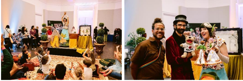
2025 La Bohème family event.

Bearitone the Opera Bear and his friends at San Francisco Opera invite you to stroll through a lively Sevillian Town Square within the Dianne and Tad Taube Atrium Theater. Inspired by Rossini's The Barber of Seville , this family-friendly experience offers a chance to explore Figaro's bustling barbershop and sneak through the Count's closet of disguises. Games, treats, live performances and a special puppet show complete the joyful and participatory adventure. To register for this free event, visit sfopera.com/sevilliantownsquare .