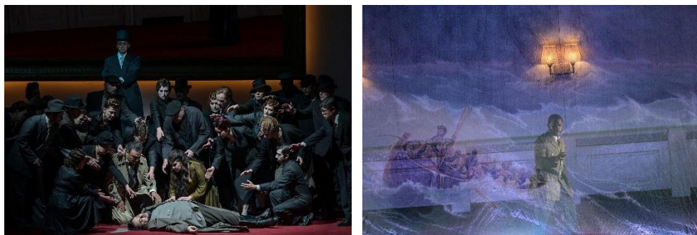
Scenes from Verdi's Simon Boccanegra

Verdi's Simon Boccanegra , a collaboration with librettist Francesco Maria Piave, had its premiere in 1857 during the composer's middle period. Working with changes to the libretto by Arrigo Boito,