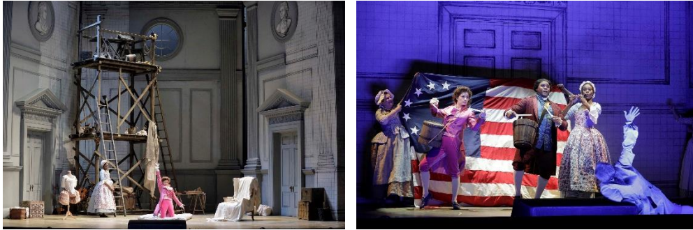
Scenes from Mozart's The Marriage of Figaro