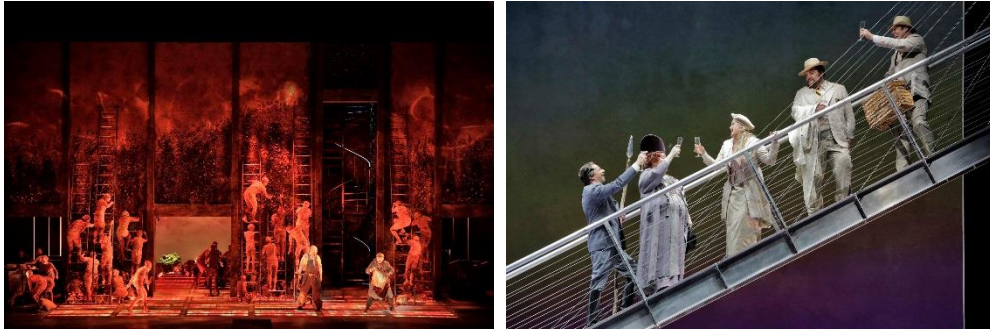
Scenes from Wagner's Das Rheingold