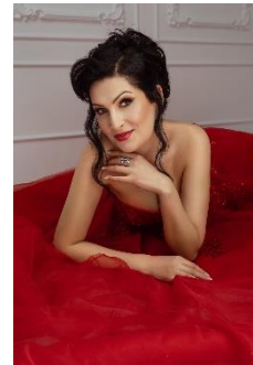
Eun Sun Kim and the San Francisco Opera Orchestra; Adela Zaharia

Following sold-out concerts performing symphonies by Ludwig van Beethoven in 2024 and 2025, Music Director Eun Sun Kim and the San Francisco Opera Orchestra return with an evening dedicated to the music of Richard Strauss. The program includes Till Eulenspiegel's Merry Pranks (the early tone poem which made Strauss a sensation); his song cycle with texts by Romantic poet Clemens Brentano and the American premiere of a new arrangement by Philippe Jordan and Tomáš Ille of selections from Strauss' 1911 opera, Der Rosenkavalier . Romanian soprano Adela Zaharia , who brought "fluting tone and steely precision to the lyrical and technical demands of Gilda [in Verdi's Rigoletto ]" ( San Francisco Chronicle ), is the vocal soloist for the Brentano Lieder .