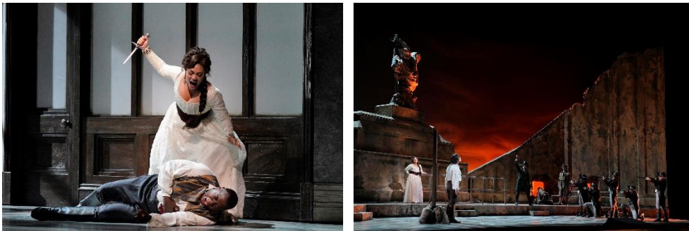
Scenes from Puccini's Tosca