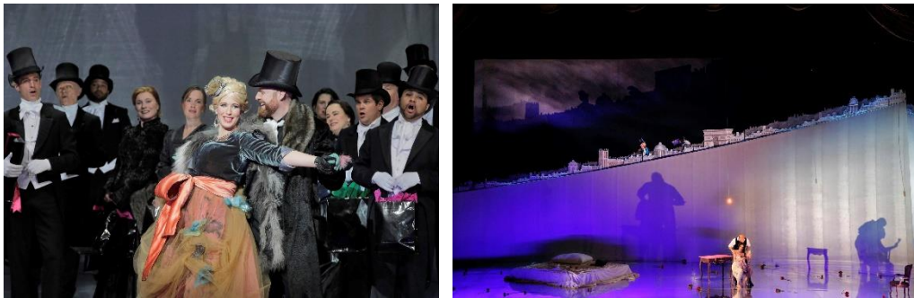
Scenes from Massenet's Manon

land menaced by the conflicting ambitions of the men that surrounded her—only in the end—ironically to be defeated and brought down by a woman, Queen Elizabeth I. Happily, Mary won the long game when her son, James VI of Scotland, became James I of England and Scotland on Elizabeth's death. I am hoping my opera will likewise continue to bring her valor, her strength and particularly her emotional journey to life in a meaningful way for today's audiences at San Francisco Opera."