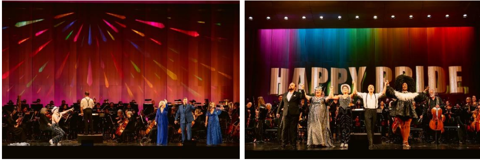
Pride Concert

San Francisco Opera honors the city's LGBTQIA+ community with the Pride Concert , a kaleidoscopic celebration of queer musical trailblazers which will take place just before San Francisco's Pride Weekend. For the third year in a row, this electrifying evening will feature the San Francisco Opera Orchestra and guest artists onstage with a dance party in the lobby after the performance. More details will be announced at a later date.