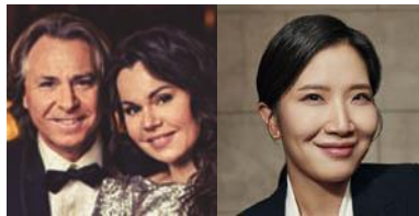
Roberto Alagna and Aleksandra Kurzak; Eun Sun Kim