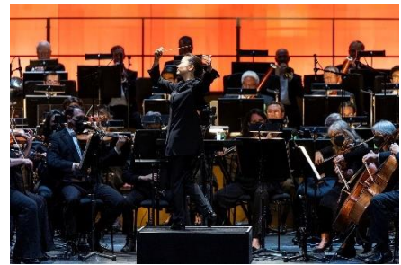
Gaetano Merola with the San Francisco Opera Orchestra (1940); Opening of the War Memorial Opera House with Puccini's Tosca (1932); Eun Sun Kim with the San Francisco Opera Orchestra (2022).