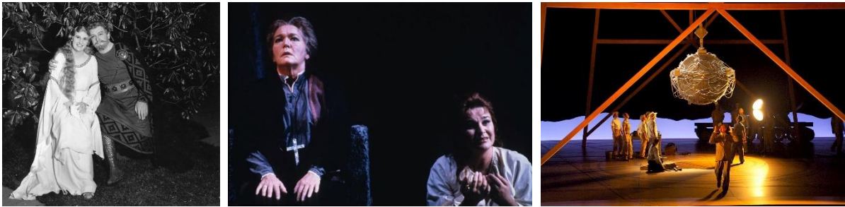
Kirsten Flagstad, Lauritz Melchior in Wagner's Tristan und Isolde (1936); Leonie Rysanek, Gabriela Benacková in Janáček's Jenůfa (1986); Adams' Doctor Atomic (2005).

Benjamin Britten and Erich Wolfgang Korngold. Excerpts from Piotr Ilyich Tchaikovsky's Pique Dame ( The Queen of Spades ) and Leoš Janáček's Jenůfa represent the proud Slavic traditions first explored by the Company in the 1930s and later with unforgettable performances and premieres that reintroduced many powerful masterworks into the repertory of American opera.