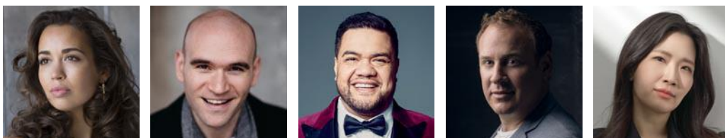
Nadine Sierra; Michael Fabiano; Pene Pati; Lucas Meachem; Eun Sun Kim