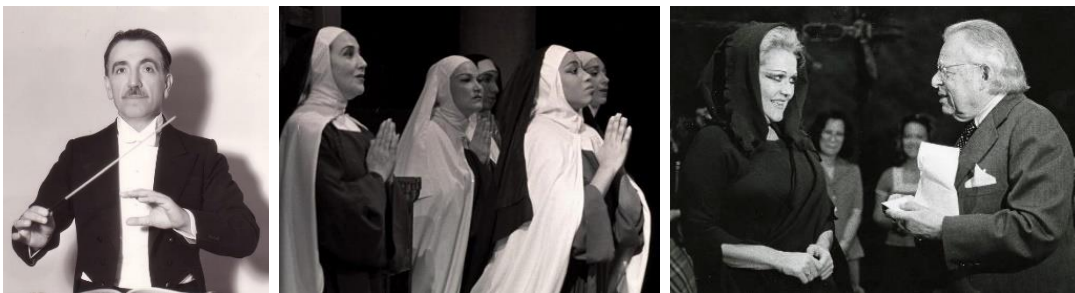
San Francisco Opera founder Gaetano Merola, 1933 ; Dialogues of the Carmelites with Blanche Thebom, Dorothy Kirsten and Leontyne Price, 1957 ; Leonie Rysanek and Kurt Herbert Adler backstage at Die Frau ohne Schatten, 1976

On September 26, 1923, Gaetano Merola inaugurated his new resident company for the opera-loving metropolis of San Francisco with a performance of Puccini’s La Bohème at the Civic Auditorium. Despite a century of forbidding challenges, from the Great Depression,