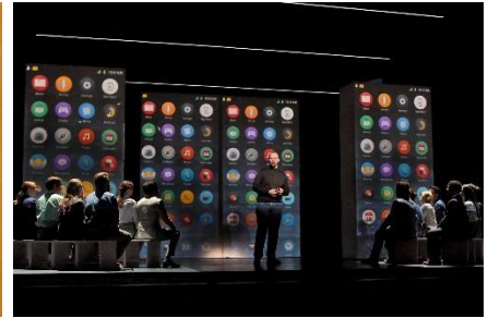
Kaija Saariaho's Innocence ; Rhiannon Giddens, co-composer of Omar ; Mason Bates and Mark Campbell's The (R)evolution of Steve Jobs

Since presenting Puccini's then still-new triptych Il Trittico in its inaugural season of 1923, San Francisco Opera has been an exponent of new music and home for gripping stories by contemporary artists. The Company has presented the American premieres of works by many twentieth century masters, including Francis Poulenc, Richard Strauss, Benjamin Britten, Maurice Ravel, Dmitri Shostakovich, Leoš Janáček, Olivier Messiaen and György Ligeti. Since 1961, the Company has been committed to commissioning new operas from living composers and presenting the world premieres of works by John Adams, Jake Heggie, Philip Glass, André Previn, Bright Sheng and others.