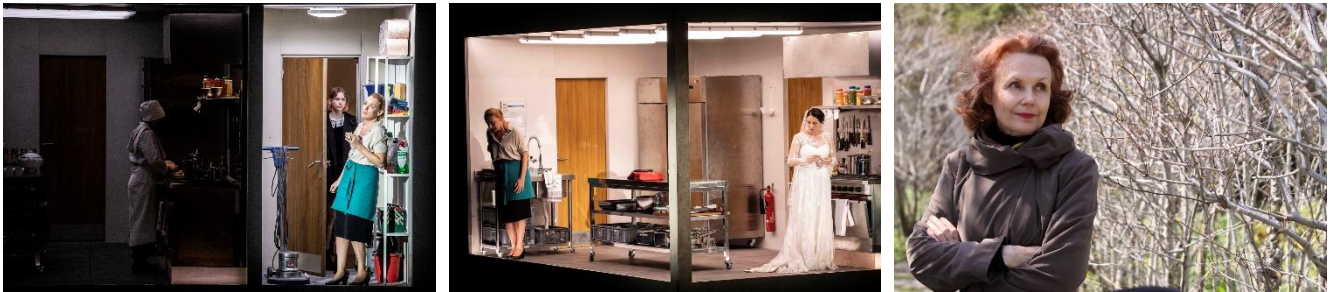
Scenes from Innocence. The late composer Kaija Saariaho.

Kaija Saariaho's final opera, with an original Finnish libretto by Sofi Oksanen and multilingual libretto by Aleksis Barrière, explores the emotional aftermath of a school shooting